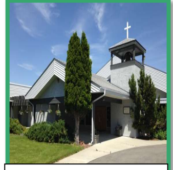
Christ the Servant Church – Cranbrook Est. 1975