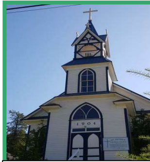
St. Peter's Church – Moyie Est. 1904