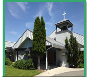
Christ the Servant Church – Cranbrook Est. 1975