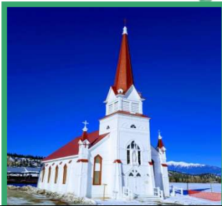
St. Eugene Church – St. Mary's Reserve Est. 1897