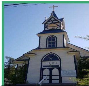
St. Peter's Church – Moyie Est. 1904