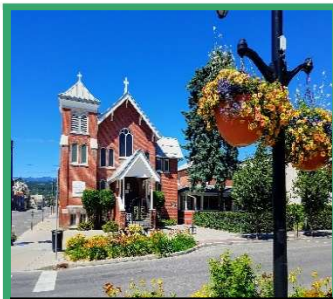
St. Mary's Church – Cranbrook Est. 1898